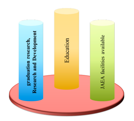
Fig. 1 Three pillars of education program on decommissioning

This educational program is designed to correspond with the "human resource development and cooperation between higher education and research institutes in the medium-and-long term viewpoint" which is related to a governmental medium-and-long term roadmap for TEPCO's Fukushima Daiichi Nuclear Power Plant. This education program is constituted by three pillars; research and